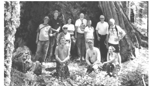
The hikers gathered at the base of the Ishi Giant

On July 13th, Wilsonia Village Inc. had the first of what we hope will be one or two annual hikes. We still do not have a name for this "group". One suggestion is the "Gimpy Geezers", but we are open for suggestions. The first hike was to the Ishi Giant. The Ishi Giant is a magnificent tree, with one of the largest bases of any Giant Sequoia. The tree has appx. 40,000 cubic feet in the trunk, making it one of the largest trees in the world. (cont on pg 2)